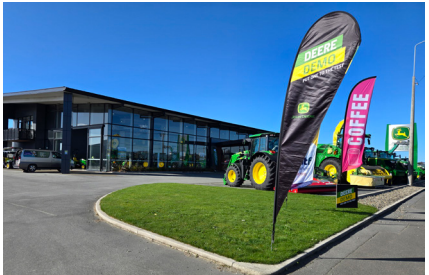
Thanks to everyone who came along, we hope you enjoyed it as much as we did!