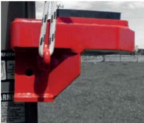
50mm Heavy Duty Postcap with Nylon Inserts

Compatible with Rockspike & Torque Drill *Accessories not included as standard