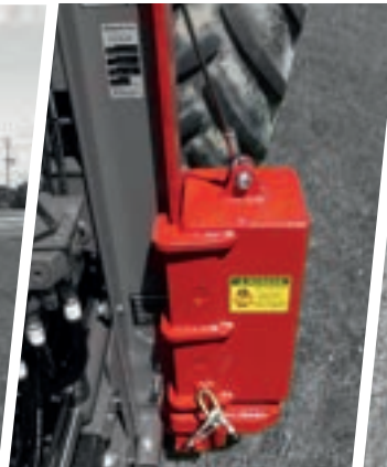
6mm Bisalloy Reinforced Mast 340kg Lead Filled Hammer