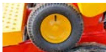
Ground drive wheel