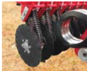
Optional Turbo Tilt opening disc