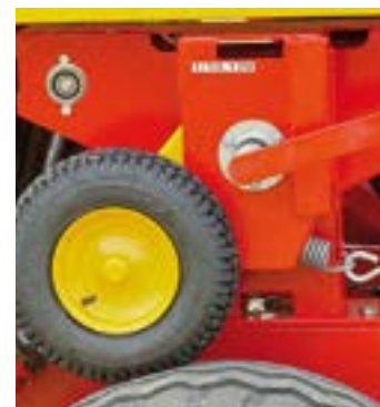
Ground driven jockey wheel