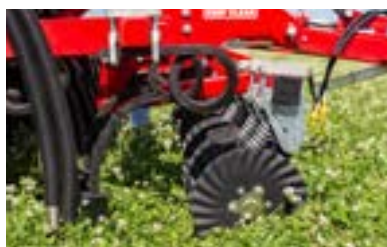
Turbo Tilth disc, tine and boot