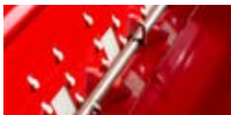
Stainless steel agitator shafts