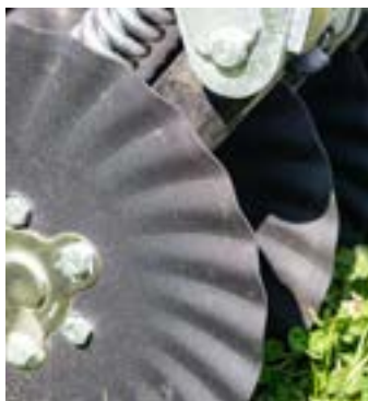
Turbo Tilth opening discs