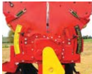
Easy to adjust, variable gearbox