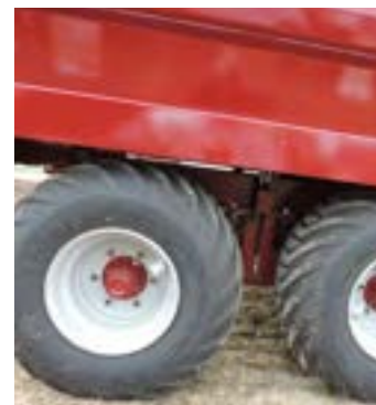
Easy, safe access for loading