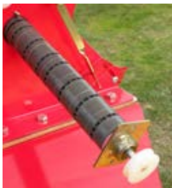
Easily changed metering cartridge