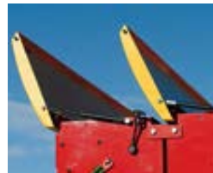
Box lids open to 110°