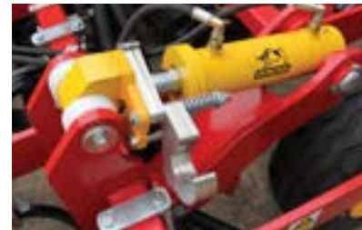
Depth adjustment on rams