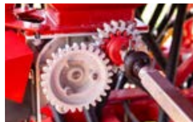
High/low range output settings