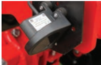
Ground following radar