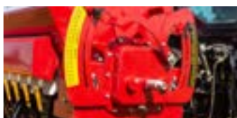
Mechanical drive gearbox