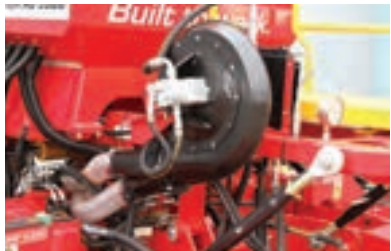
Hydraulic fan with splitter