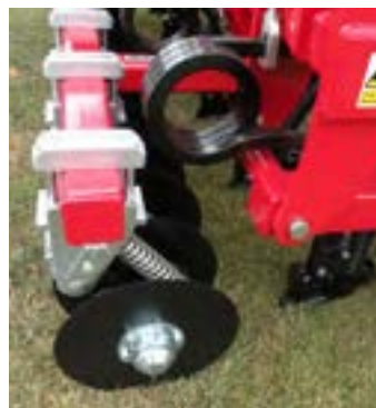
Opening disc & tine/boot/point