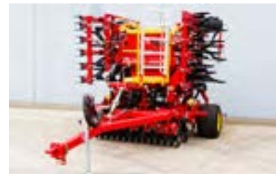
Folded for transport