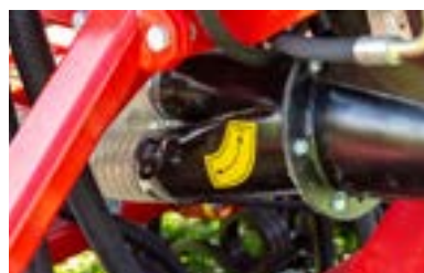
Split airflow, butterfly valve