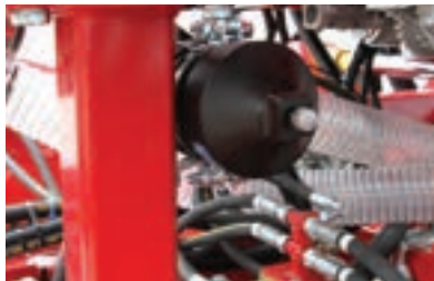
Hydraulic accumulator for holding wing pressure