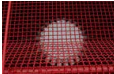
Mesh screen and distributor head in the hopper