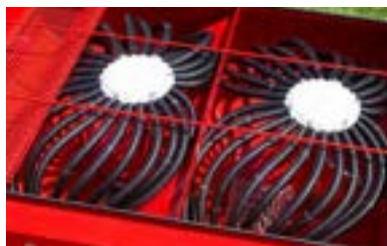
Split hopper with concealed distributor heads