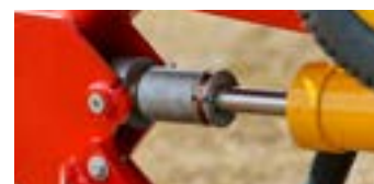
Depth adjustment on the ram